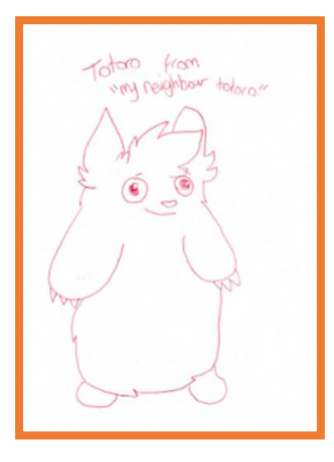
Some fantastic creativity seen across the year groups, both at home and in school.